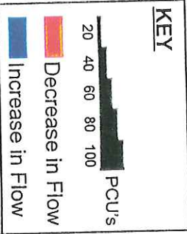
PM Peak Hour Modelled Flow Changes - Option B, Wincheap Junction Improved