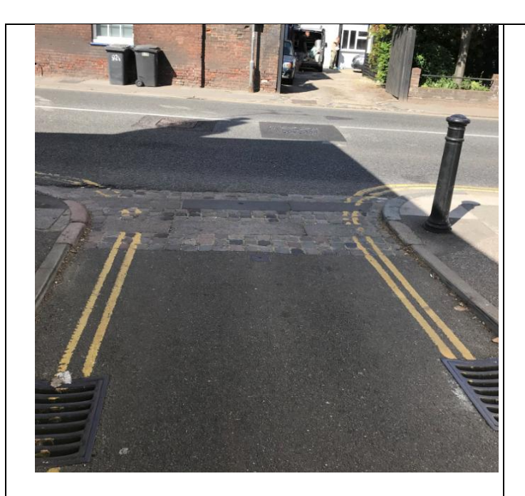
Frame 1 ~ Road Gullies at the end of Old Ruttington Lane looking towards Broad Street