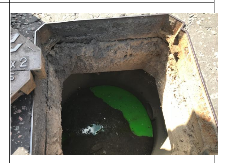
Frame 4 ~ Drain Dye emerging at TR15582001