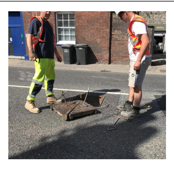
Frame 2 ~ Cover to TR15582001 removed under traffic control