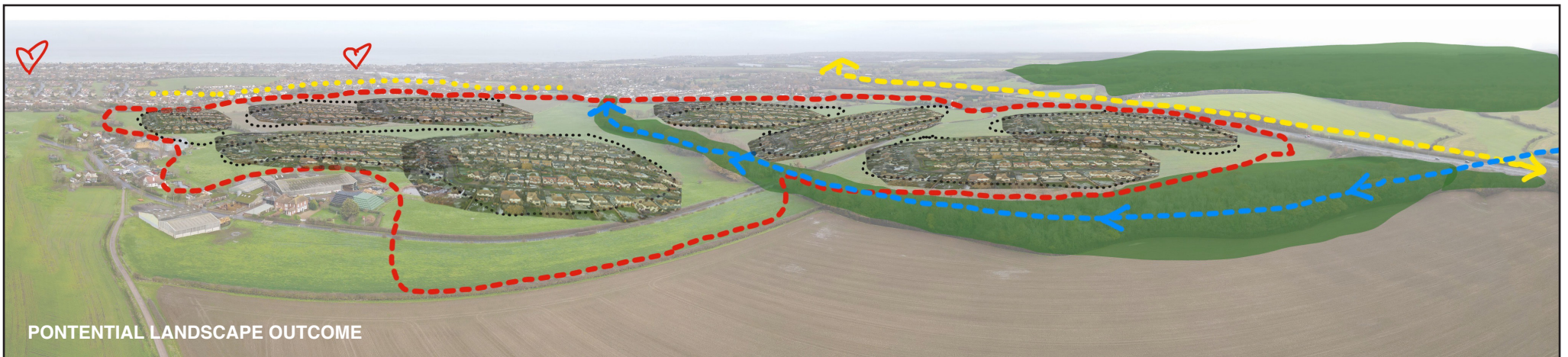
PONTENTIAL LANDSCAPE OUTCOME