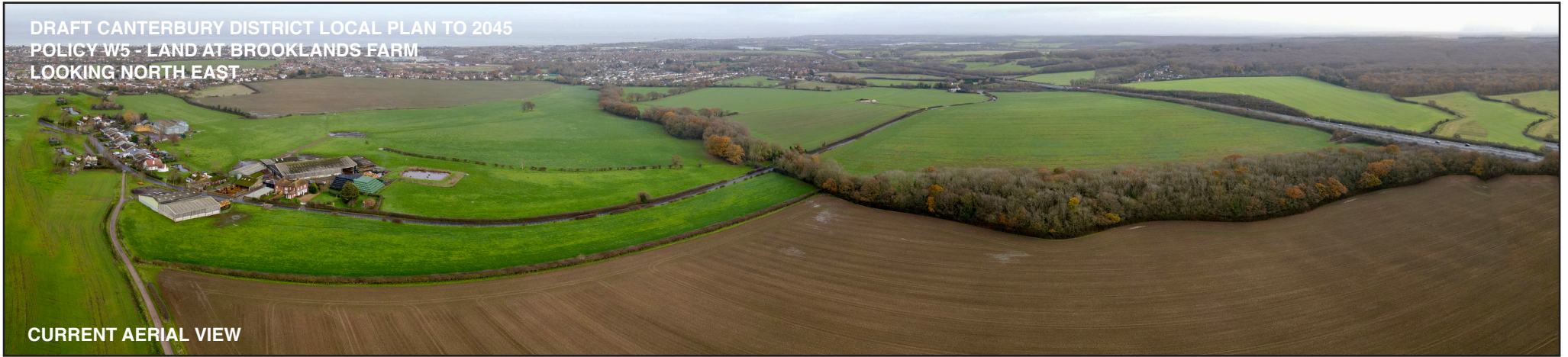
CURRENT AERIAL VIEW