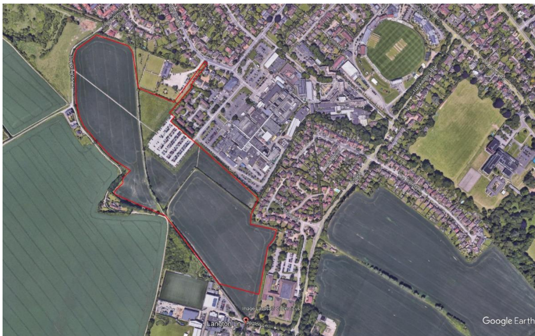
FIGURE 2.1: LAND AT RIDLANDS FARM (GOOGLE EARTH)