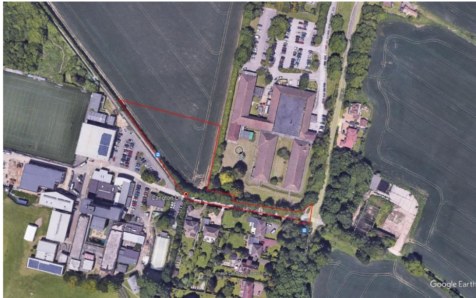
FIGURE 2.2: LAND AT LANGTON LANE (GOOGLE EARTH)