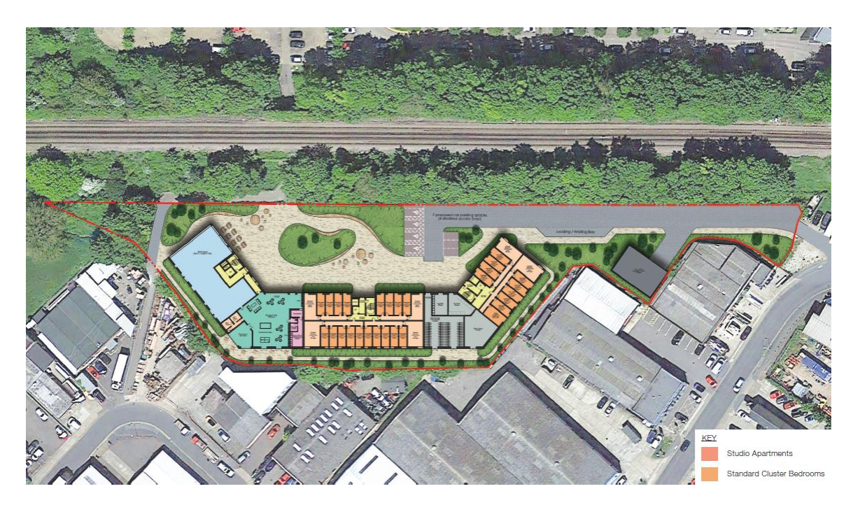
Figure 3: Potential Development Site Layout