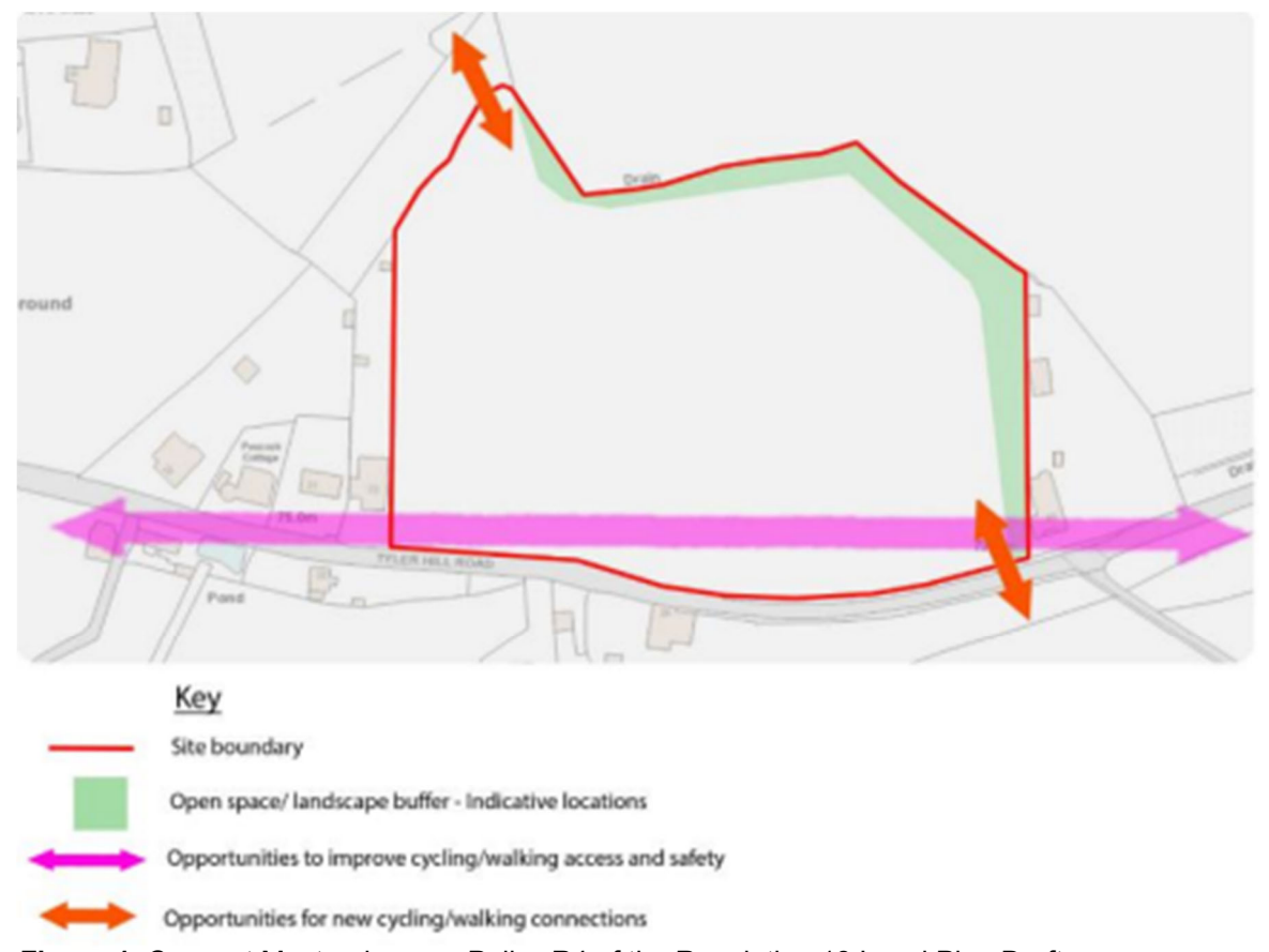
Figure 1. Concept Masterplan, per Policy R4 of the Regulation 18 Local Plan Draft

Overall, the provisions of Policy R4 are wholly supported in principle.