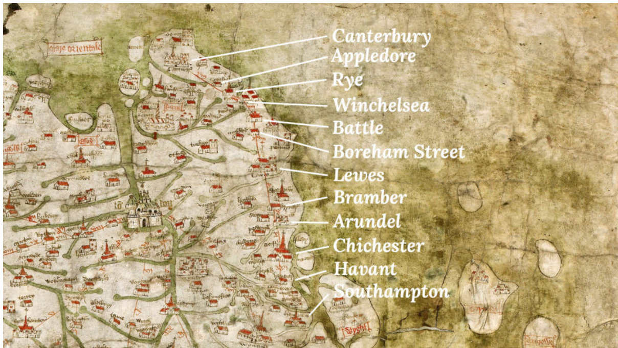
The original Old Way route

The section which concerns us is shown below.