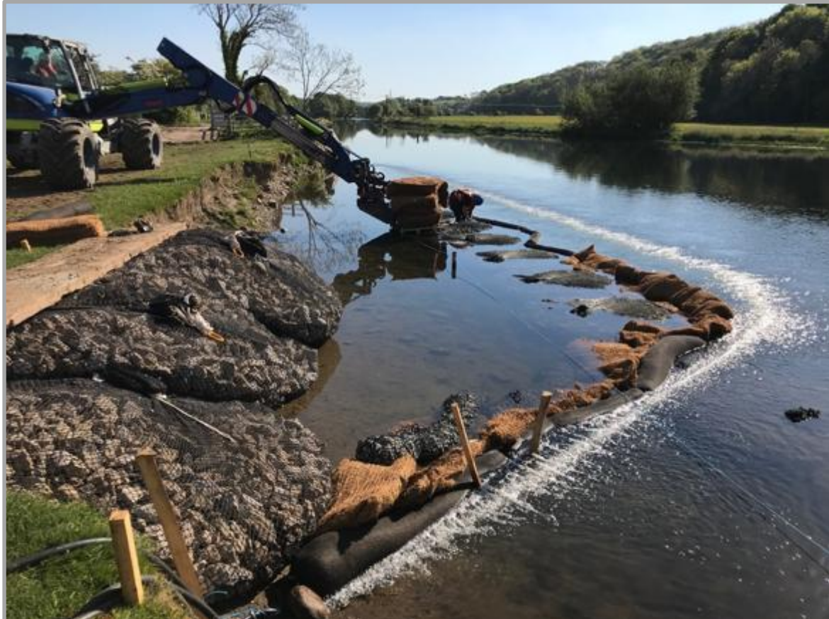
Figure 3-1 Silt Wattles, Silt Mats and Bubble Barrier to control sediment release (Photo courtesy of Frog Environmental).

Where water depths are greater than 250mm, the use of SiltMats will be ineffective. Instead, a bubble curtain should be used to control the mobilisation and transport of fine sediment. The bubble curtain should be 'rolling', i.e. be moved through each site as each element is completed. The bubble tubing should be laid on the channel bed, in an elongated 'D' shape that encompasses each structure that is being constructed, or if the structures are close together, encompasses the works within that site. Bubble curtains are effective in flows up to 1.5 m.s -1 and can be used in conjunction with Silt Wattles, SiltMats and rock rolls to effectively control sediment release.